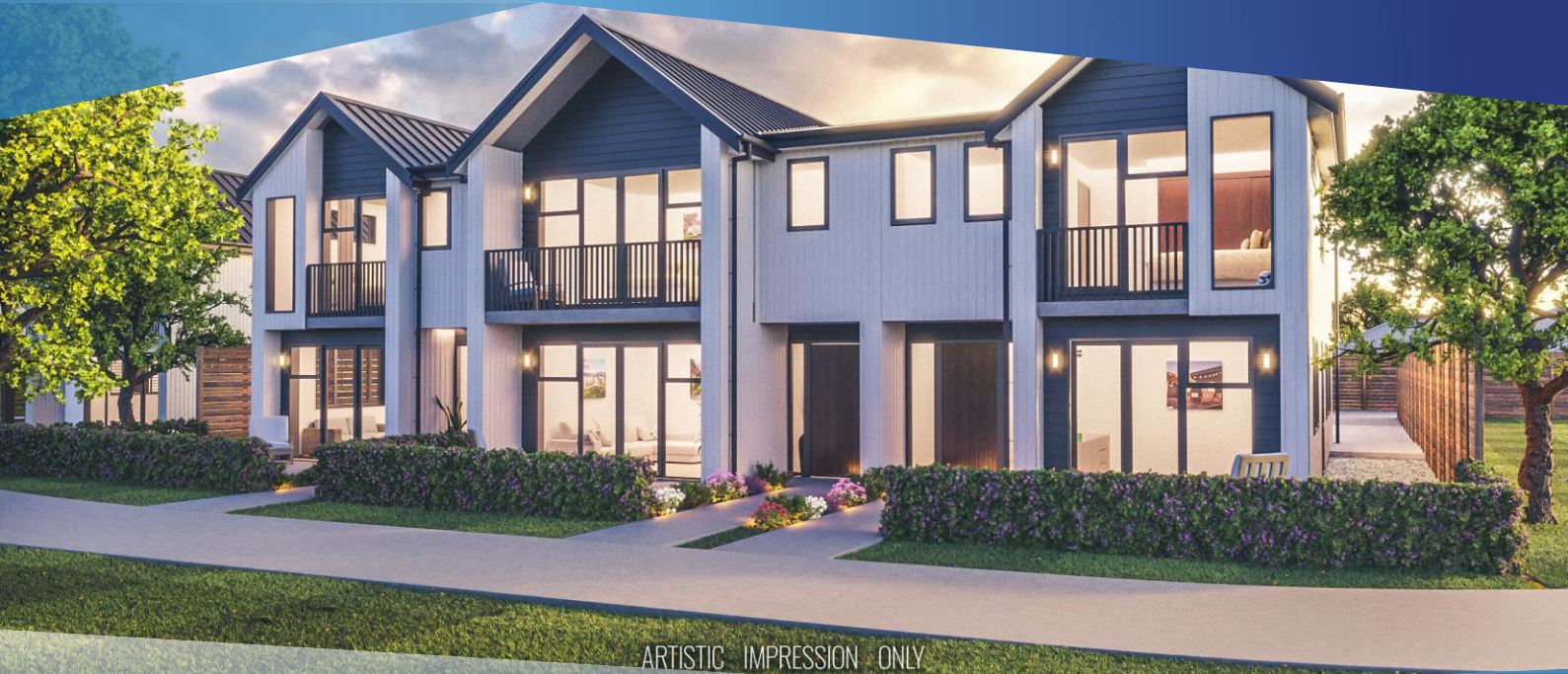
ARTISTIC IMPRESSION ONLY